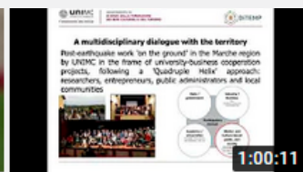
DiTEMP Webinar Linking students and entrepreneur...